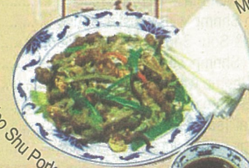
Moo Shu Pork