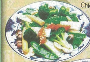
Steamed Bean Curd w. Mixed Veg.