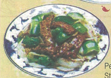
Pepper Steak w. Onion