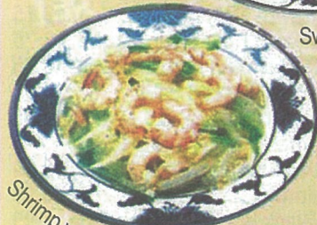
Shrimp w. Mixed Veg.