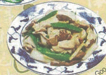
Moo Goo Gai Pan