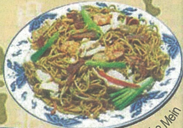
House Special Lo Mein