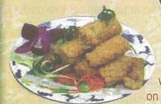
Fried Calamari w. Black Bean Sauce on Side