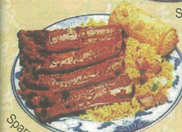
Spare Ribs Combo