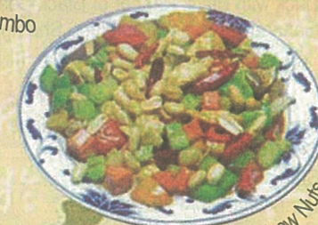
Chicken w. Cashew Nuts