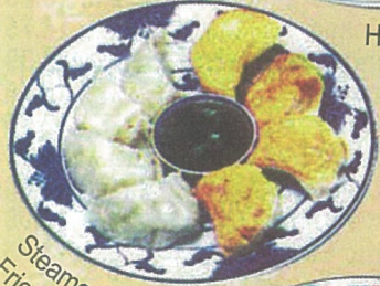
Steamed or Fried Dumpling